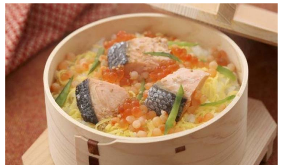
WAPPA Rice (Local mixed rice)